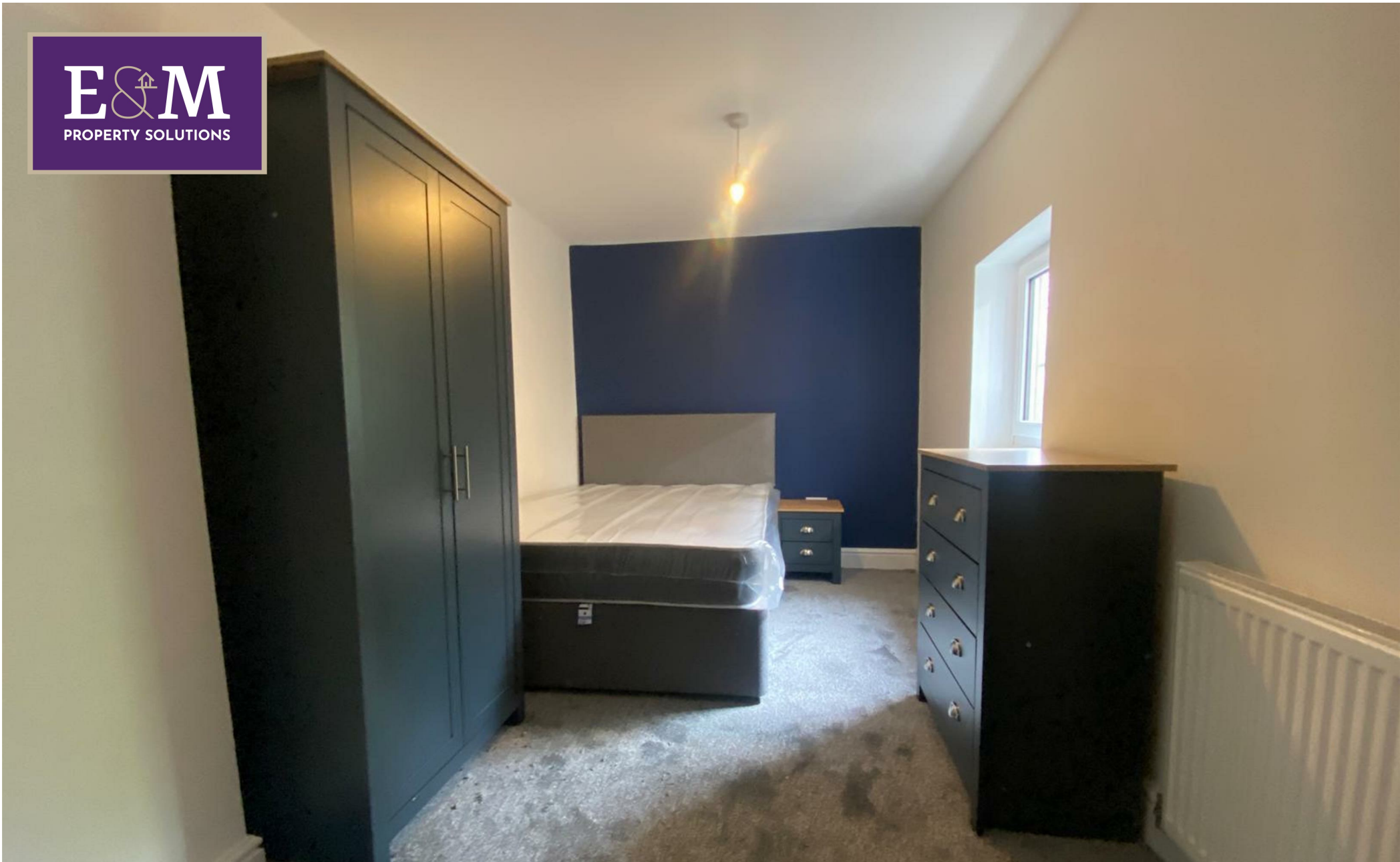
Room 2, 27 Deepdale Road, Preston, Lancashire, PR1 5AP £105 Per week